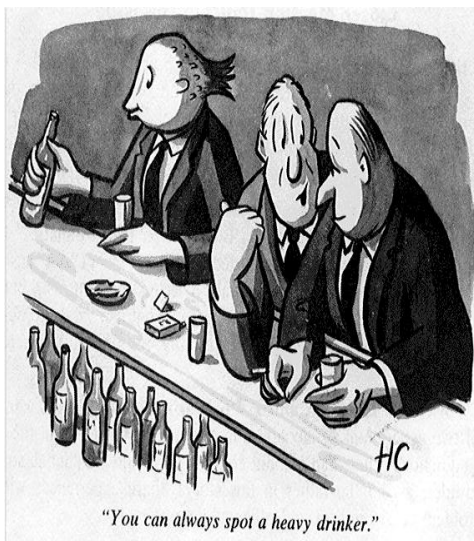
taken from The Grapevine , April 1972